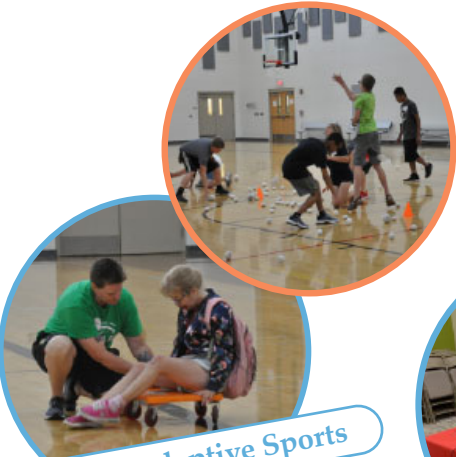
Can Play Adaptive Sports